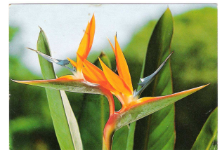
Highway Region Emblem